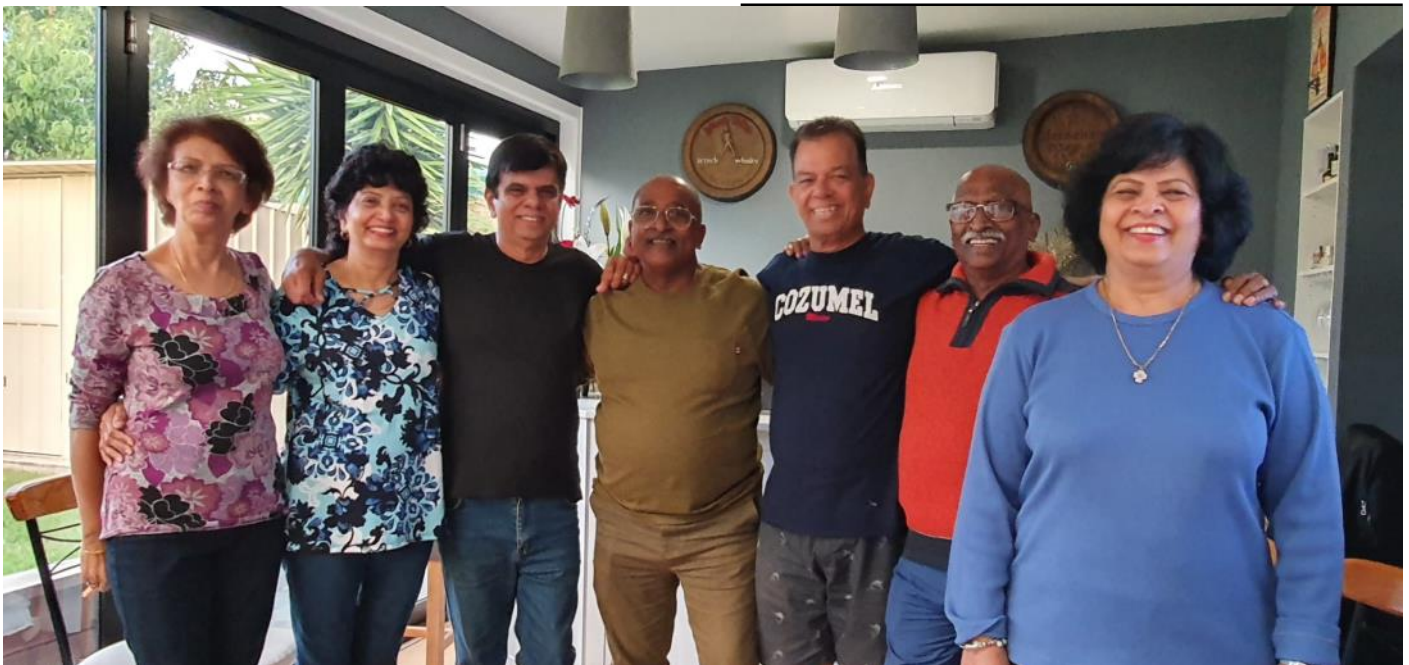
NEIGHBOURLY LOVE !