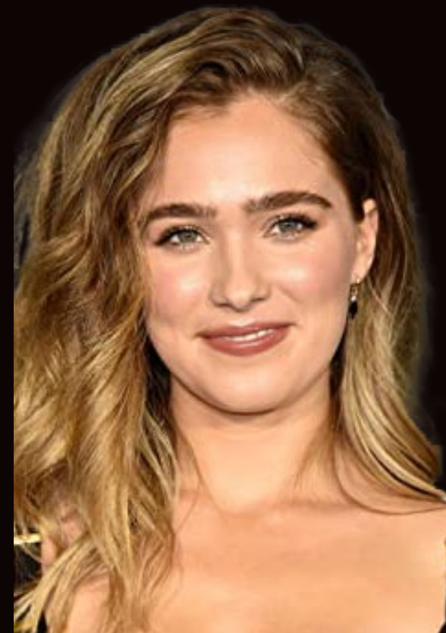
Haley Lu Richardson