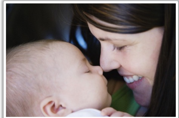
Access Your Bliss

Bliss *On activates Order, Immune system health & wellbeing, Negentropy while Bliss *Off allows Depression, Disease, Chaos and Entropy.