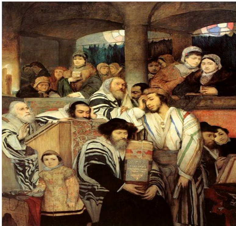
NINETEENTH CENTURY ASHKENAZI JEWS OF VIENNA IN THEIR SYNAGOGUE ON YOM KIPPUR

MANY ASHKENAZIM LATER MIGRATED, LARGELY EASTWARD, FORMING COMMUNITIES IN GERMANY, HUNGARY, POLAND, RUSSIA, EASTERN EUROPE, AND ELSEWHERE BETWEEN THE TENTH AND NINETEENTH CENTURIES. FROM MEDIEVAL TIMES UNTIL THE MID-TWENTIETH CENTURY, THE LINGUA FRANCA AMONG ASHKENAZI JEWS WAS PRIMARILY YIDDISH.