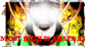
The True Image of Messiah

Let no man (Your Church Pastor OR Any Man in fact) deceive you with vain words: for because of these things cometh the wrath of God upon the children of disobedience.