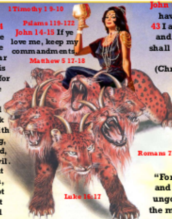
The great harlot, who sitteth upon many waters

1 John 3:8 He that committeth sin is of the devil; for the devil sinneth from the beginning. For this purpose the Son of God was manifested, that he might destroy the works of the devil.