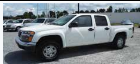
2006 GMC Canyon SLE1 Crew Cab 4WD