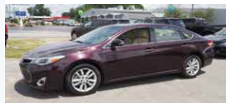
2014 Toyota Avalon- 6 cylinder