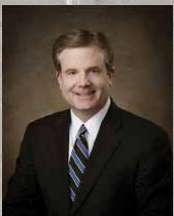
Mayor Lew Starling

Thank you for voting me "One of the Best Elected Officials in Sampson County"