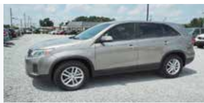
2015 Kia Sorento LX 2WD