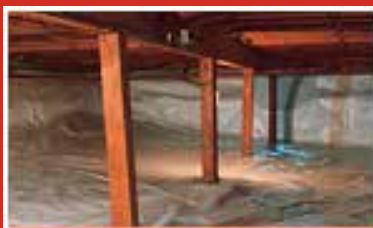
Crawl Space Repair