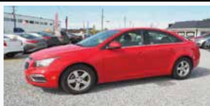
2016 Chevrolet Cruze Limited 1 LT Auto