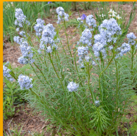
Amsonia Hubrichtii Arkansas Blue Star