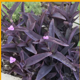
Setcreasea Pallida Purple Heart