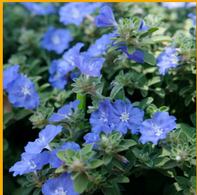
Evolvus Beach Bum Blue