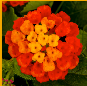
Lantana Hot Blooded