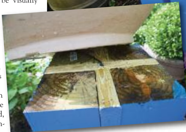
△ Oversized fiberglass bowls atop pedestals are overflowing with an assortment of tropicals and are ready for the spring and summer months ahead.