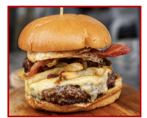
The Breakfast Burger