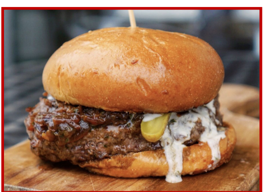
Le Steakhouse Burger

Kid's Combo 12 years & under 8.99 aged 12 & up add $2