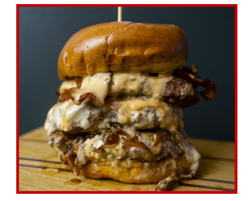
The BOSS Burger