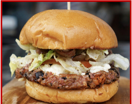
Greek Veggie Burger