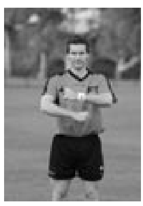
Run too far