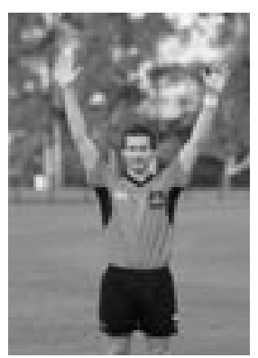
All clear behind