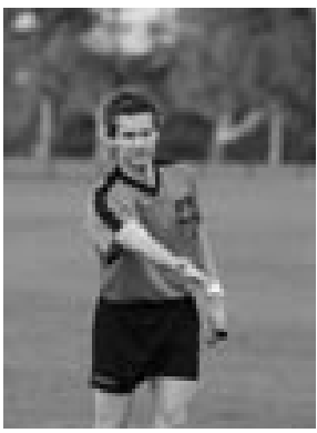
Deliberate out of bounds