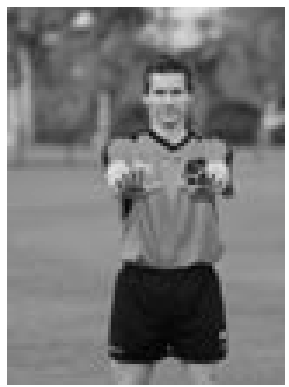
Push in the back