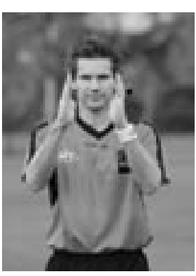
All clear goal