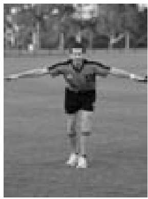
Holding the ball