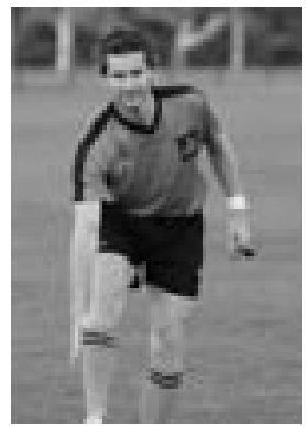
Kicking in danger