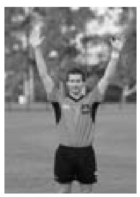
All clear behind