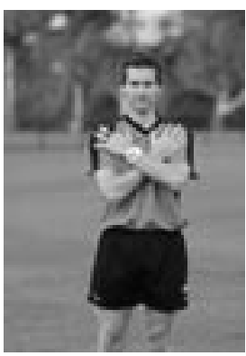
Field bounce/throw up