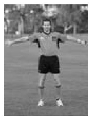
Illegal shepherd/block Holding the man