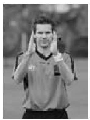
All clear goal