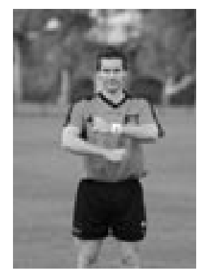
Run too far