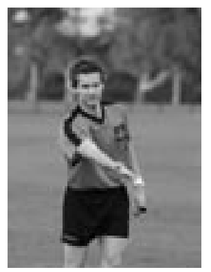
Deliberate out of bounds