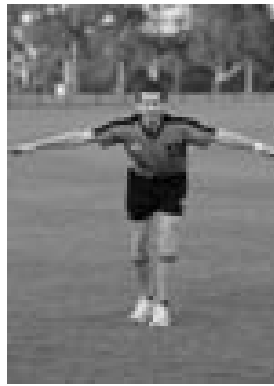
Holding the ball