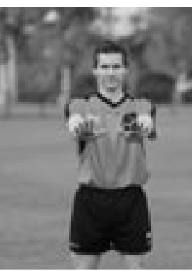
Push in the back