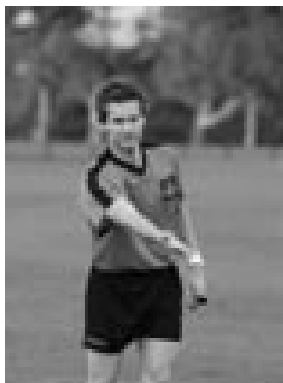
Deliberate out of bounds