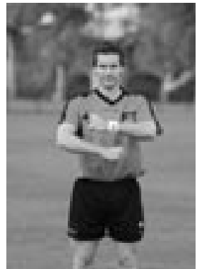
Run too far