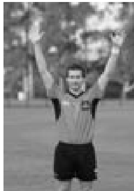
All clear behind