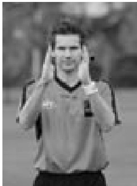
All clear goal