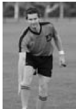
Kicking in danger