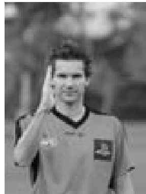
End of game