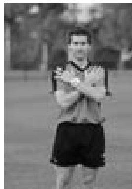
Field bounce/throw up