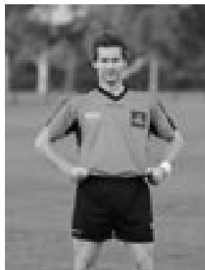
Holding the man