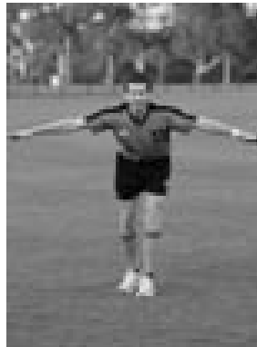
Holding the ball