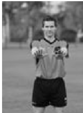
Push in the back