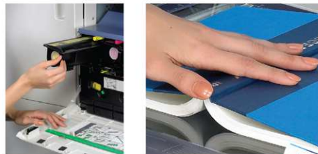
Print professional-looking, full-color newsletters and brochures using an optional saddle-stitch or staple finisher.