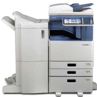
e-STUDIO5055c with Saddle-Stitch Finisher.