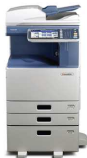
e-STUDIO5055c with Large Capacity Feeder.