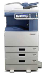
e-STUDIO5055c with Paper Feed Pedestal.