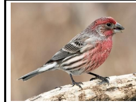
House Finch (male)