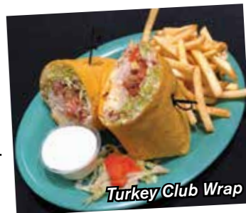
Turkey Club Wrap

Lean turkey, lettuce, tomato, bacon, avocado, Jack cheese served with ranch dressing. $15.50