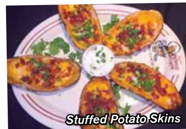
Stuffed Potato Skins

Five spuds deep fried and topped with Cheddar, bacon bits and chives. Served with sour cream. $15.75