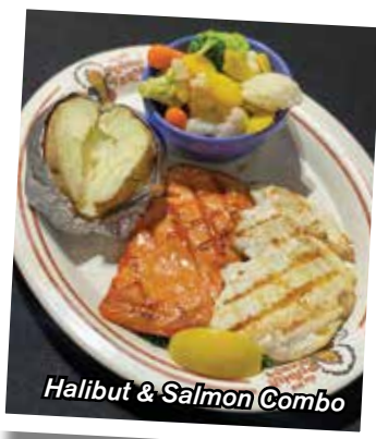
Halibut & Salmon Combo

A fillet of each, the best Alaska has to offer. Market price.