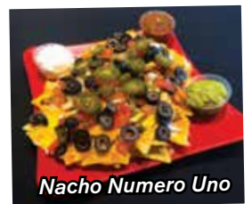
Nacho Numero Uno