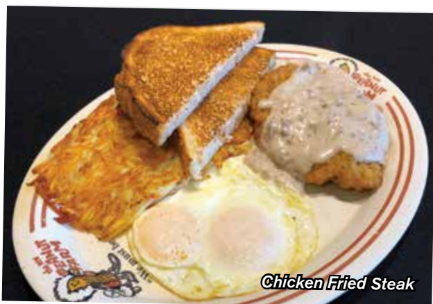
Chicken Fried Steak

2 eggs, hash browns or home fries and white or wheat toast. $18