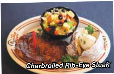
Charbroiled Rib-Eye Steak

One full pound hand cut with just a touch of tex-mex flavor. $36