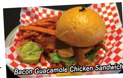
Bacon Guacamole Chicken Sandwich

Bacon, guacamole, & American cheese. $17.75