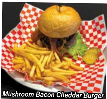
Mushroom Bacon Cheddar Burger

Spicy Cajun crusted patty and buffalo sauce. $15