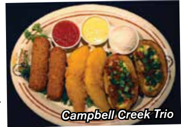
Campbell Creek Trio

Potato skins, Mozzarella sticks, and Chicken strips. $16.75 (No substitutions.)