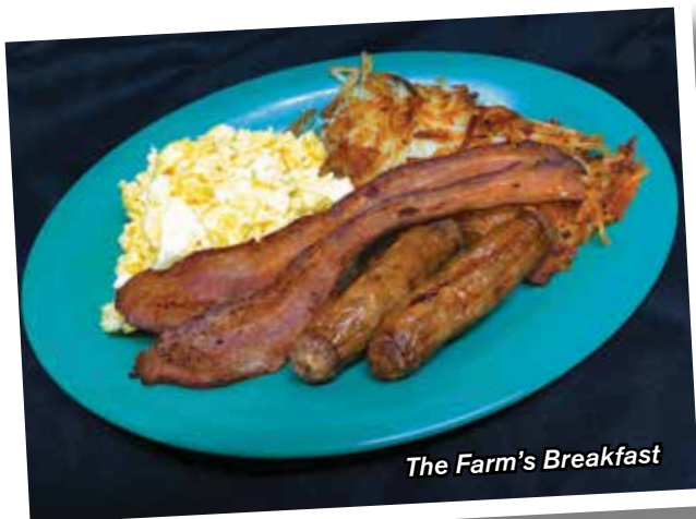
The Farm's Breakfast

2 scrambled eggs, 2 pieces of bacon, 2 sausage links and hash browns. No Substitutions! $13.75