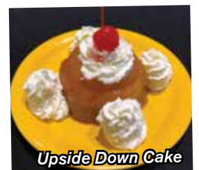
Upside Down Cake

A single serving of paradise in Alaska. $8.25