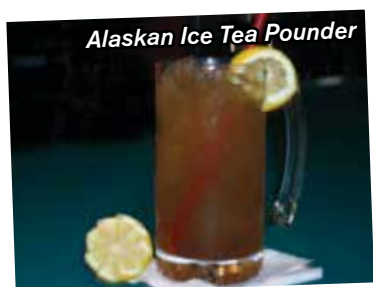
Alaskan Ice Tea Pounder

A 25 oz. powerhouse proudly made with Tito's, Bacardi, Tanqueray, José Cuervo, Triple Sec Liqueur, Sweet and Sour and Coca-Cola. *Limit two (2) per customer. $17.50 Add strawberries $1