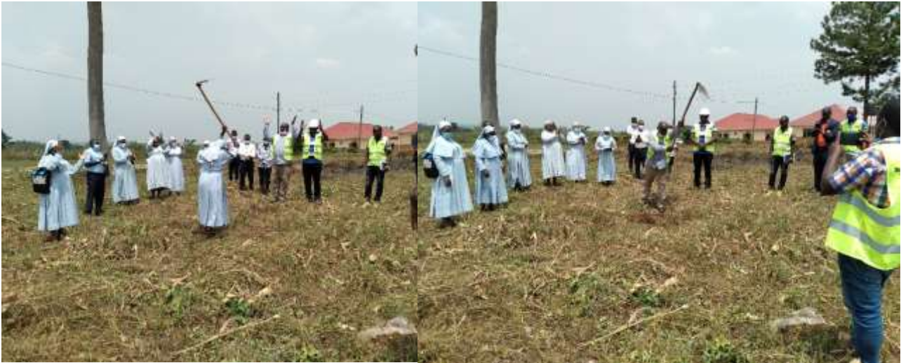
The Mother General and the Contractor breaking the ground