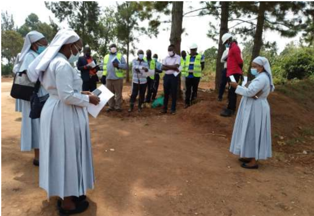
The Administrator (far right) of Rwibaale Health Centre briefing the team before the start of the ground breaking ceremony for the Doctors' and Guests' housing project