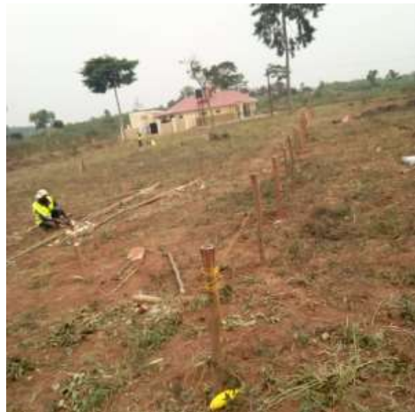
The Contractor setting up profiles for the construction of the two buildings