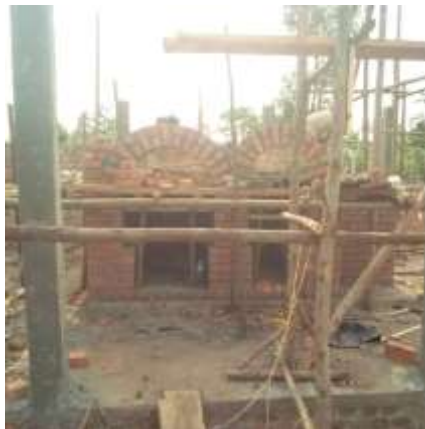
Construction of the incinerator