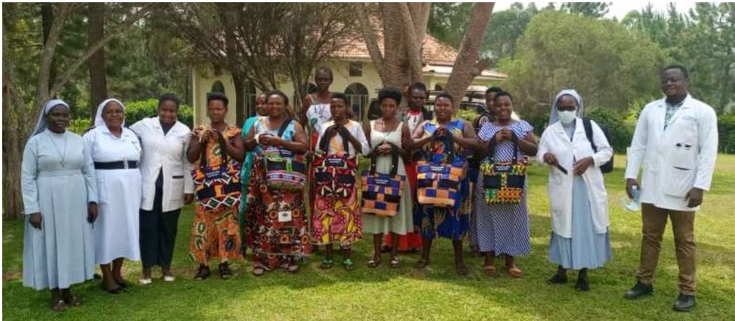
Patients happy after surgery and upon receiving packages (symbols of starting new life) provided by AMH