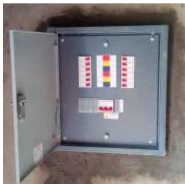
Circuit breaker installed