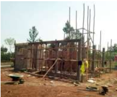
Construction of the Shade around the incinerator