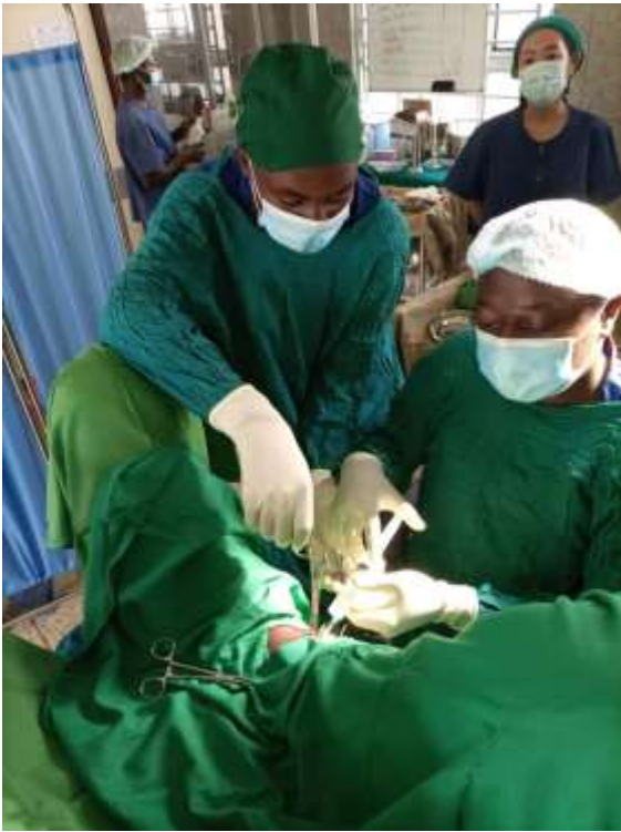
The 2 residents performing a surgery