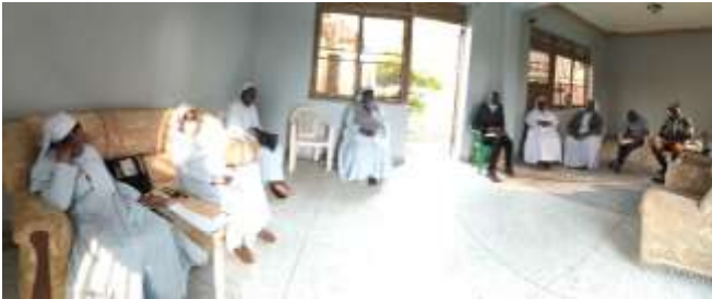
Meeting with Contractor after inspection of the projects