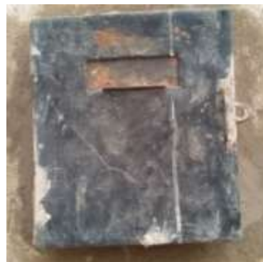
Meter Box installed