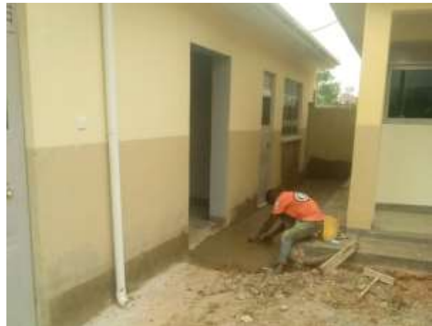
Rectifying Snags at the Doctor's House