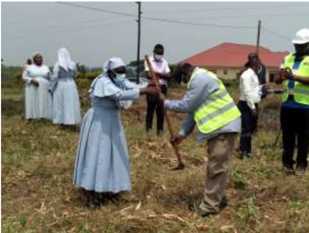
The Mother General handing the construction site to To the Contractor