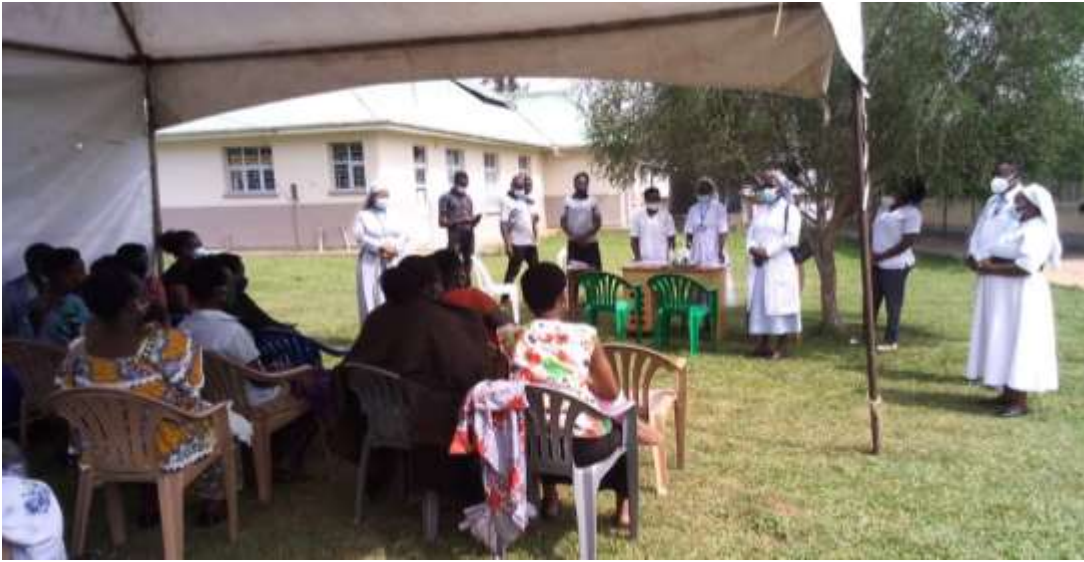
Surgical Camp Team having entry meeting with patients