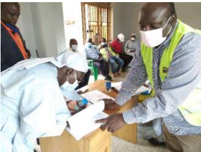
Mother General of Banyatereza Sisters & Contractor signing the Contract