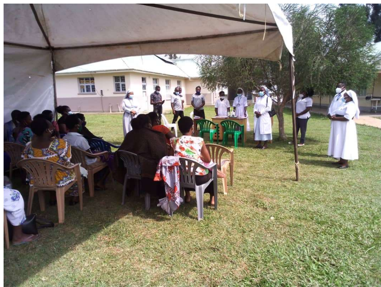
Rwibaale Birth Injury Surgical Camp Team entry meeting with patients.