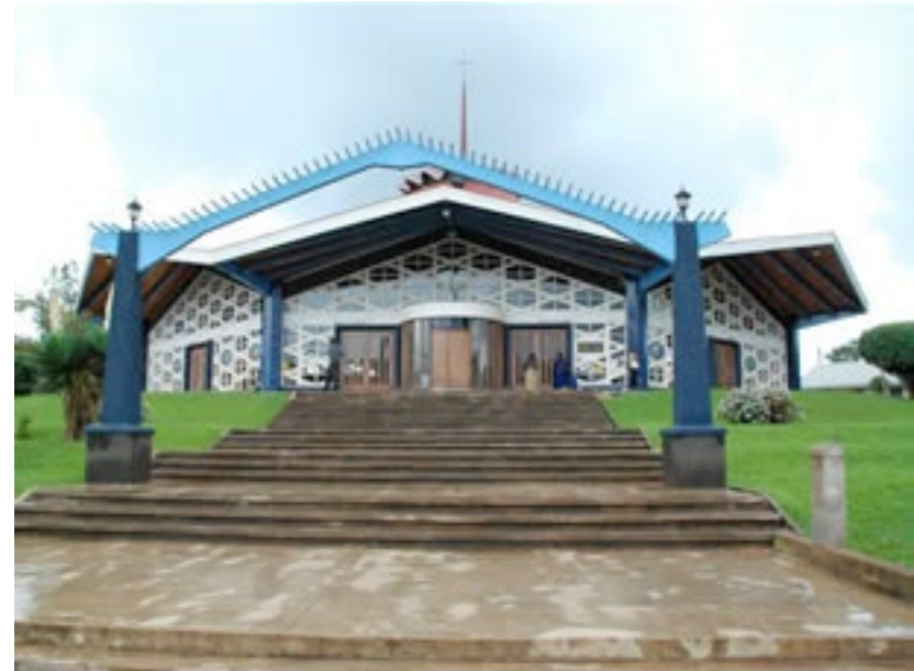
OUR LADY OF SNOWS, VIRIKA CATHEDRAL