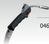
Push Pull Torch (24 V)