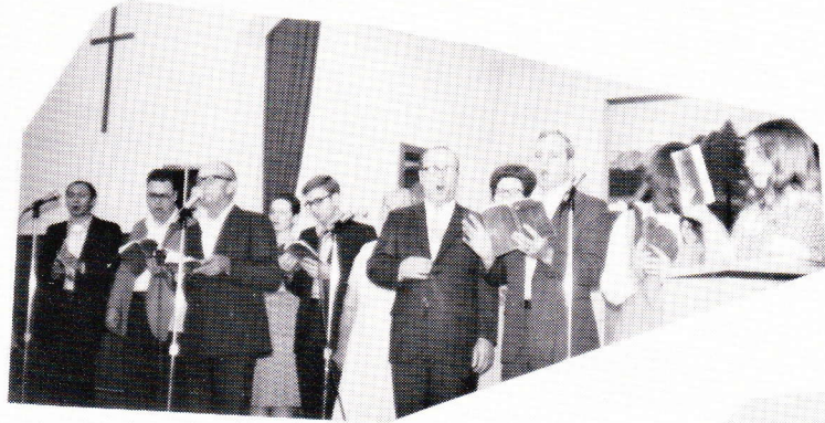
"PEACE IN THE VALLEY"