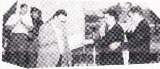
THE THREE JIMMYS