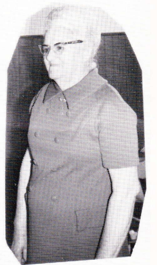
SIS. MINNIE'S BOYS ARE SINGING