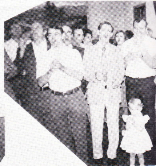
REUNION AND SINGING PRAISE