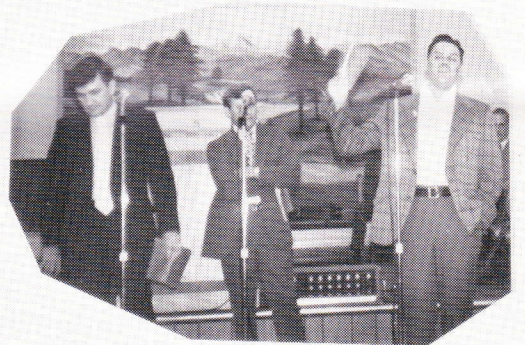
THE SINGING SCRAPIRONS