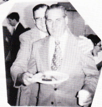
Guilty or Not Guilty?