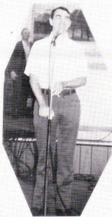
THE POOR RICH MAN