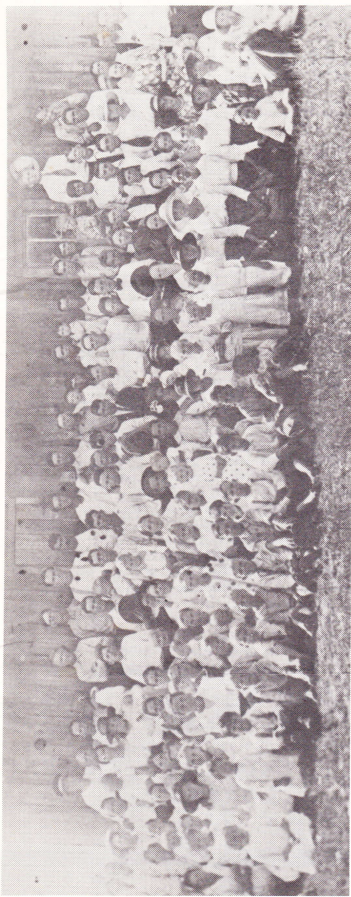
After the first outpouring of the Holy Ghost on Gunter's Mtn in 1911, some of the local preachers at Free Home on the lower end of the mountain sent word that they were coming up