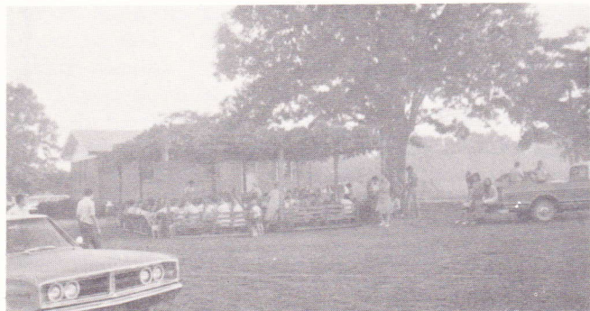
A holiness brush arbor near Sutton Alabama in the summer of "75".