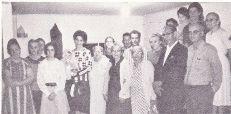
At KEELS MTN a few month after they moved into this building.