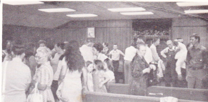
Dismissal at IDER's new church building