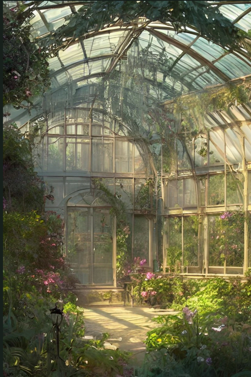
Hawaiian Bio Reserve English Garden Greenhouse Zen Garden Tropical Floristry Ikebana