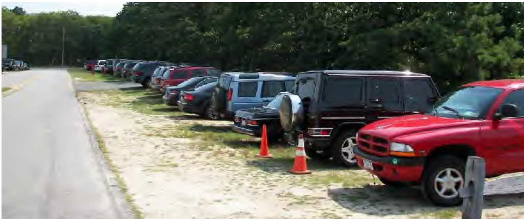
Approximately 50 on-grass parking spaces across the entrance drive from the lot.

In addition, there are approximately 50 parking spaces (plus staff parking) on the grass across the entrance drive from the parking lot. The airport management has proposed that a portion of this area be occupied by Hertz (the terminal counter lease of which is up for renewal) and Enterprise (which is a sublessee of Sound) and other car rental companies using signage to prohibit all other users; parking would no longer be free for these companies. This could be implemented quickly unless paving is required (which we believe is expected by car rental customers) and would require enforcement with or without paid parking.