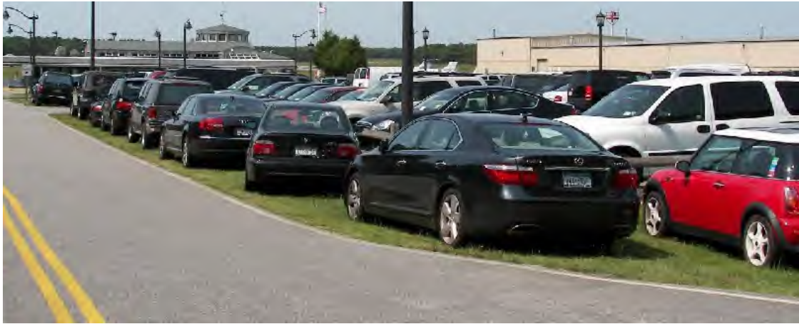
On-grass parking just outside parking lot beside entrance drive to Terminal Building