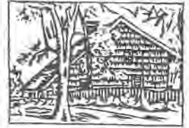
HOME SWEET HOME DEDICATED TO THE MEMORY OF JOHN HOWARD BAYNE AND HIS FAMOUS BORN "HOME SWEET HOME" MAINTAINED BY THE VILLAGE AS A MUSEUM