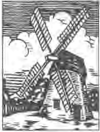
THE HOOK MILL ONE OF THE EARLY LONG BEARD MILLS USED BY EARLY SETTLERS TO GRIND WHEAT, CORN AND OTHER GRAIN. BUILT IN 1630, IT WILL OPERATE ONLY ON THE PUBLIC