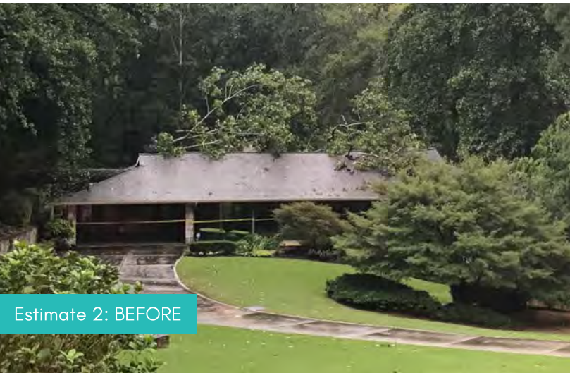
Estimate 2: BEFORE