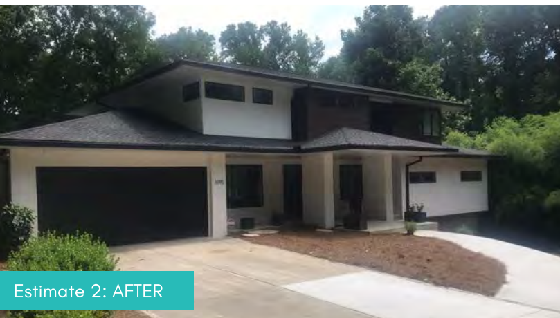
Estimate 2: AFTER