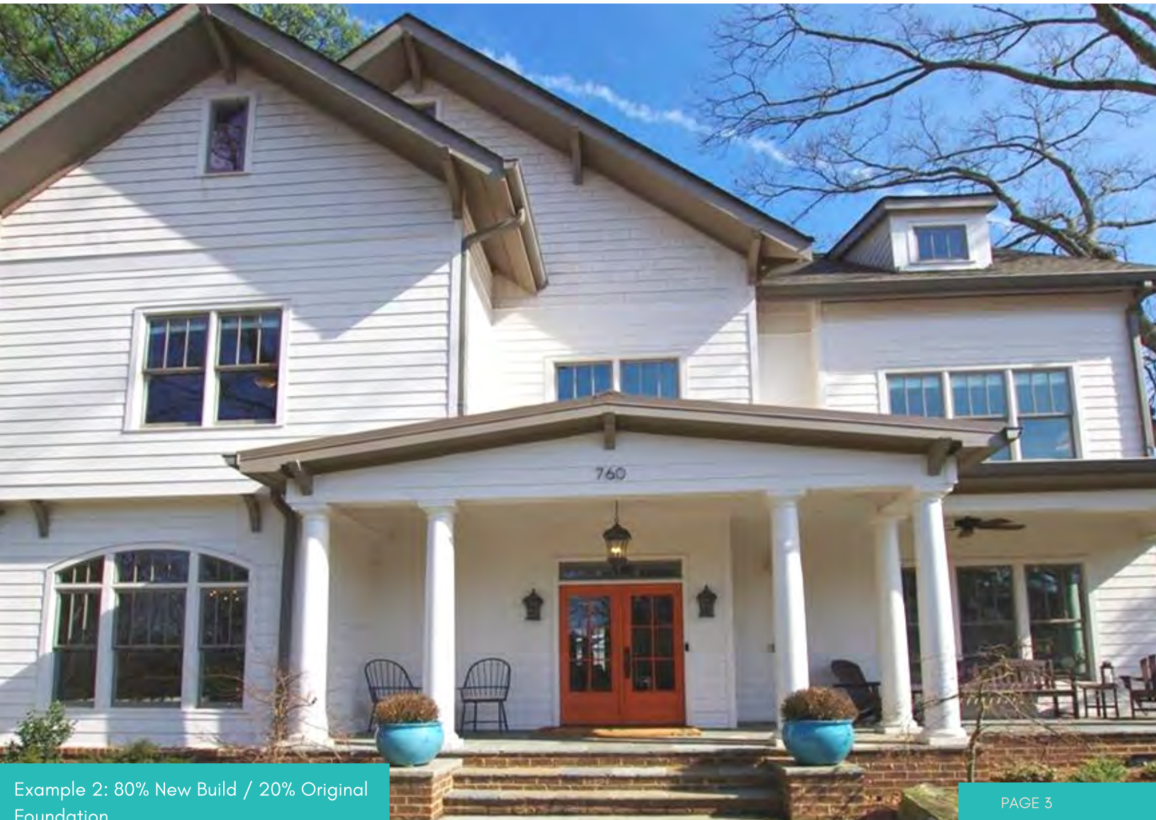
Example 2: 80% New Build / 20% Original Foundation

6,500 Square Foot Home in Atlanta $1,417,000 | $218 per square foot