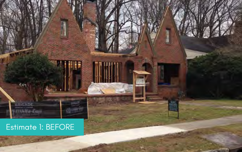
Estimate 1: BEFORE