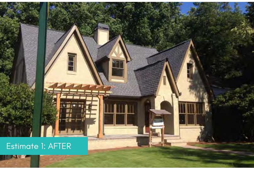
Estimate 1: AFTER