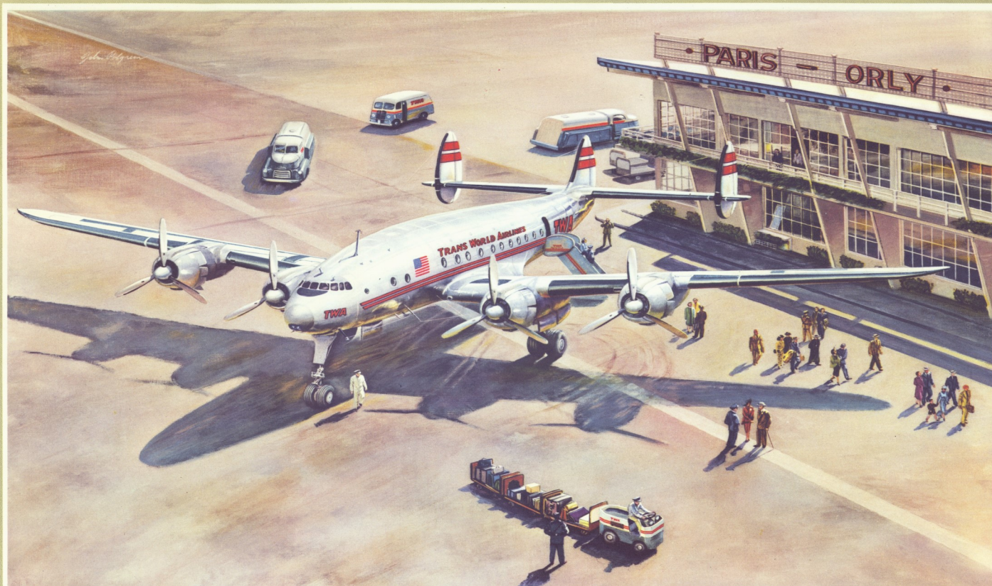
FRANCE...Orly Field, Paris