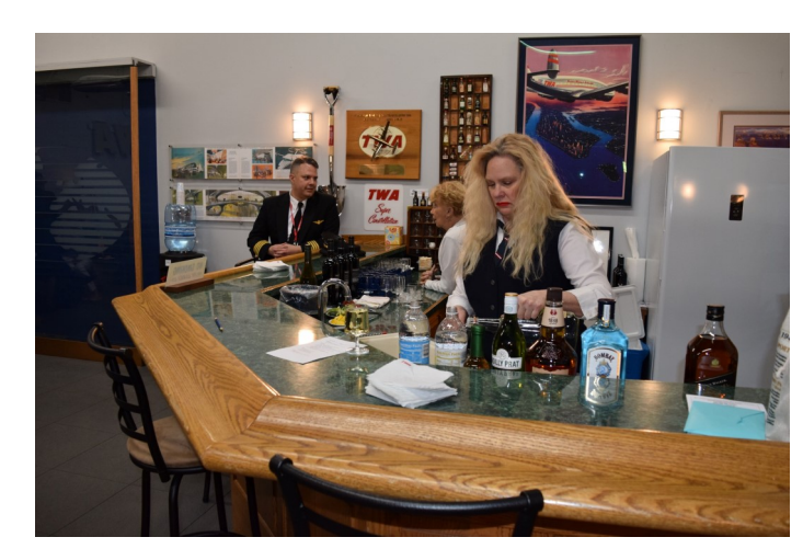
We also hosted the Airline Archivists and Historians Association annual meeting on June 25-27! It was a busy month for us!