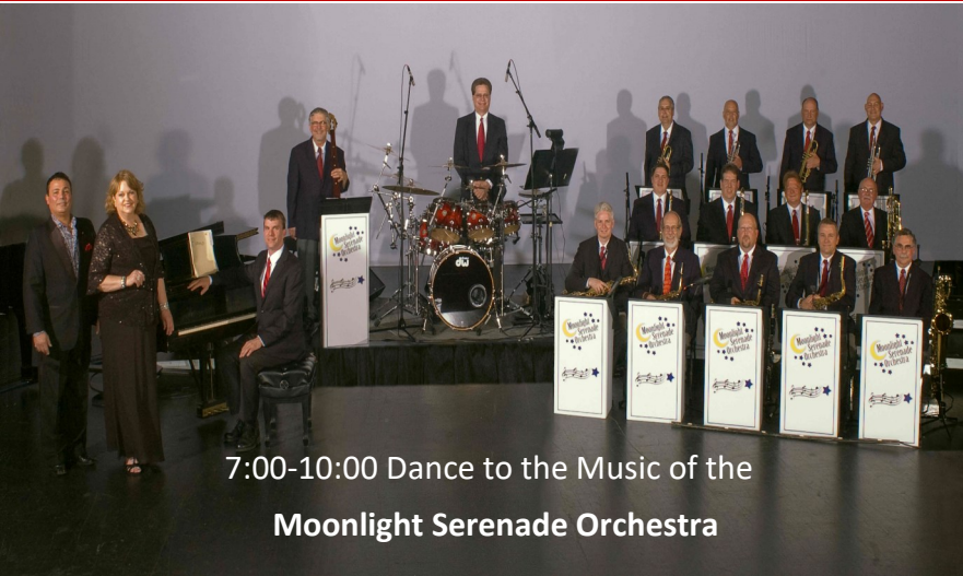
7:00-10:00 Dance to the Music of the Moonlight Serenade Orchestra

Where: Signature Flight Support Hangar at 10 Richards Road, Kansas City, Missouri