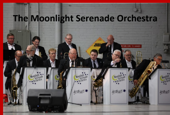
The Moonlight Serenade Orchestra

The thunderstorms held off until after the dance and the night was so magical we wonder if Cinderella was in attendance that night???? She left her shoes behind!