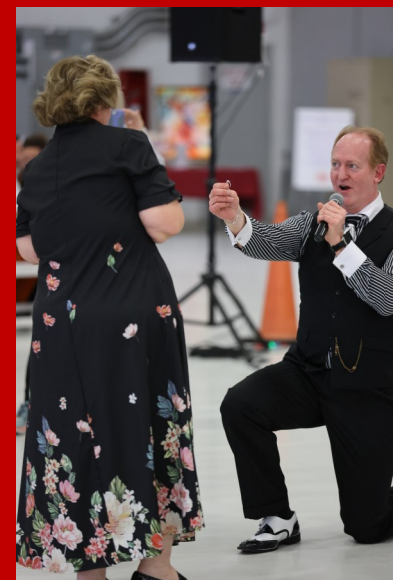
Former TWA Hostesses (Clipped Wings) were in attendance and sold TWA Cookies! There was even an engagement this year! That was a TWA Museum Hangar Dance First!