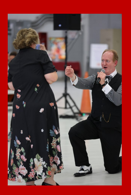
Former TWA Hostesses (Clipped Wings) were in attendance and sold TWA Cookies! year! That was a TWA Museum Hangar Dance First!