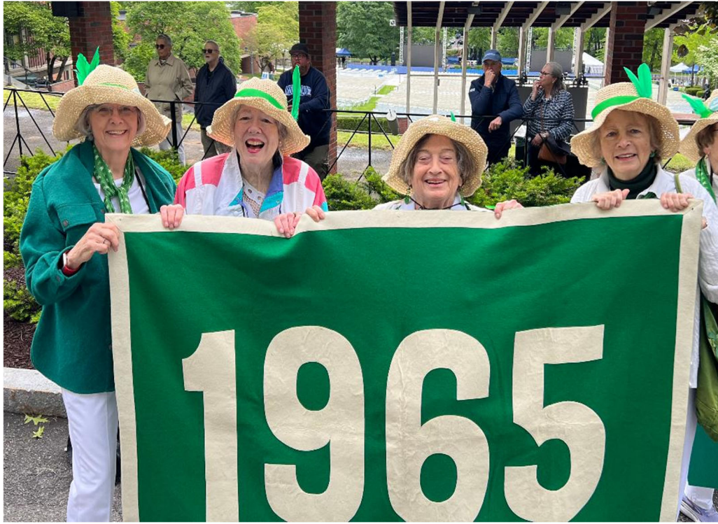
Saturday morning dawned with brilliant sunshine and graced our traditional alum parade. Here we are, carrying our banner, and wearing our festooned sun hats.