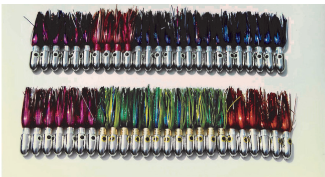
Assorted Colors Available at Serious Tackle

are available at Serious Tackle in LaMarque, Texas. There are slight differences in each of these models. The Serious Tackle wahoo bomb has chrome plated lead heads with multicolor mylar skirting. Important design features of all of them is a "sliding head" and a stop bead and crimp on their 90# cable leader system. The sliding head has an advantage and a disadvantage - the advantage is the head shaking kingfish or wahoo can't use the weight of the head to help dislodge the hook. The disadvantage is that, after the hookup, the head and its skirting could be slung up the cable to the swivel where it might generate a second strike from another kingfish or wahoo, resulting in a cutoff. The stop bead and crimp on the cable eliminates the problem. Hot color combinations for these sure-fire strike generators are black/purple, black/red, blue/white, and red/white.