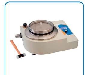
Laboratory Air-Jet Lab-Sieves