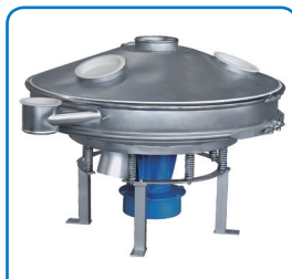
Vibrating Tumbler Screeners