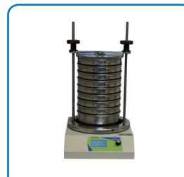
Laboratory Sieve Shakers