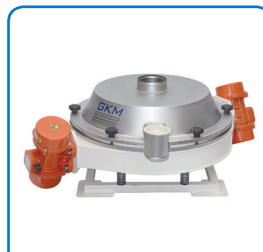
Vibrating Control Screeners