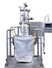
Bulk Bag Handling