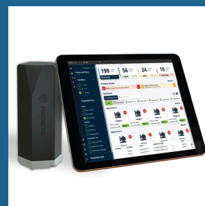
Predictive Machine Monitoring