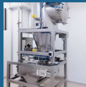
Mechanical and Pneumatic Conveyors