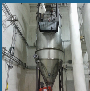
Dust Collection and Drying