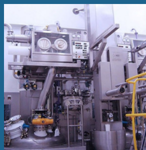
Sampling and Containment