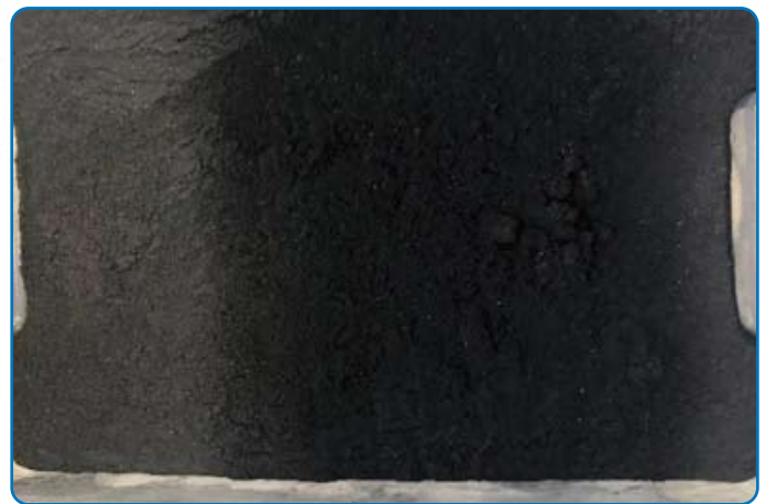
Black mass approx. 40 – 50%