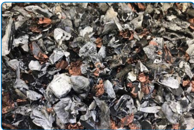
Foils, aluminum, cooper etc.