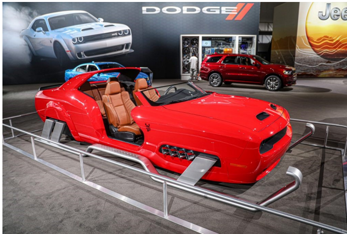
Santa's Sleigh - Red Eye HELLCAT!!!

The Cabin Fever Car Show that is normally held in January has been changed to June 11-13. Will be at the Knoxville Expo Center.