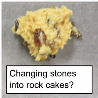
Changing stones into rock cakes?

We had 4 families at Messy Church, 3 in person and 1 online. That gave a total with helpers of 10 adults and 10