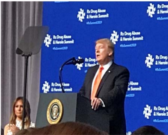
President Trump addresses the audience at The 2019 Rx Drug Abuse and Heroin Summit