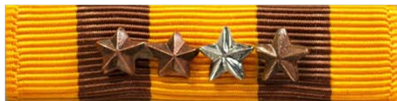
8-5. Arrangement for Wearing Large or Miniature Medals, Number of Medals Per Row.