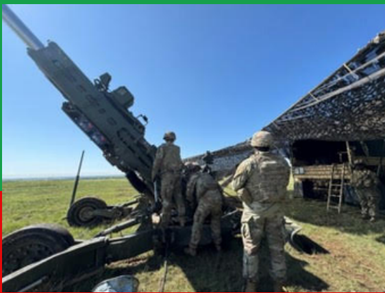
CUTTHROAT BATTERY PRACTICING PLATOON OCCUPATIONS AND FIRE MISSIONS PROCESSING IN PREPARATION FOR ARTILLERY TABLE XII.