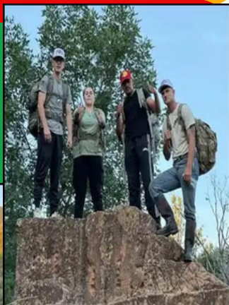
FURY'S MAINTENANCE PLATOON HIKING RED ROCKS OPEN SPACE AND 3 RD SQUAD POSING FOR A PHOTO DURING A SHARP AWARENESS HIKE.

WHILE WE MARKED THIS CHANGE AT HOME STATION, OUR MISSION CONTINUES FORWARD. ACROSS THE SOUTHERN BORDER, OUR FORWARD-DEPLOYED BATTERIES REMAIN ENGAGED IN CRITICAL SUPPORT OPERATIONS. SOLDIERS FROM ABLE BATTERY HAVE BEEN MAKING A DIFFERENCE NOT ONLY THROUGH THEIR ASSIGNED DUTIES BUT ALSO BY VOLUNTEERING THEIR TIME IN THE YUMA, AZ COMMUNITY. THANK YOU FOR YOUR SELFLESS SERVICE!