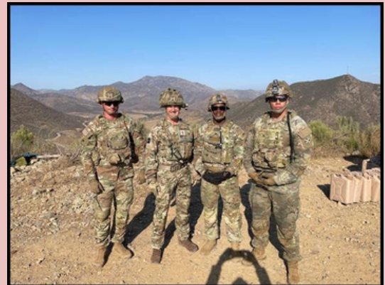
MG Cox supports B/2-77FA at the Southern Border.

We are extremely grateful to our Soldiers' families for their unwavering support - your strength and encouragement make these accomplishments possible!