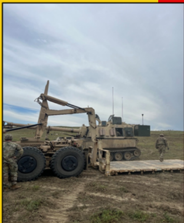
SOLDIERS FROM THE DISTRO PLATOON PRACTICE RESUPPLY OF A PALADIN.