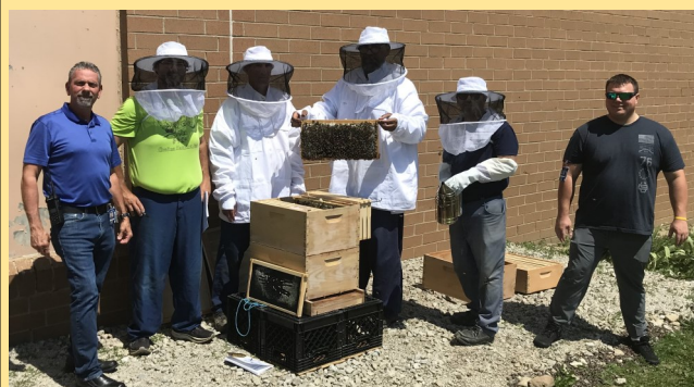
Grafton Correctional Institution Apiary