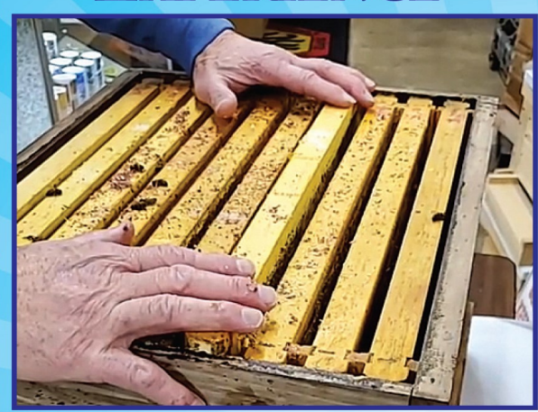
QRC Diagnosis of Your Honeybee Colonies. Call Today for an Appointment! Over 100 years of combined beekeeping experience! You Can Rely On Us!