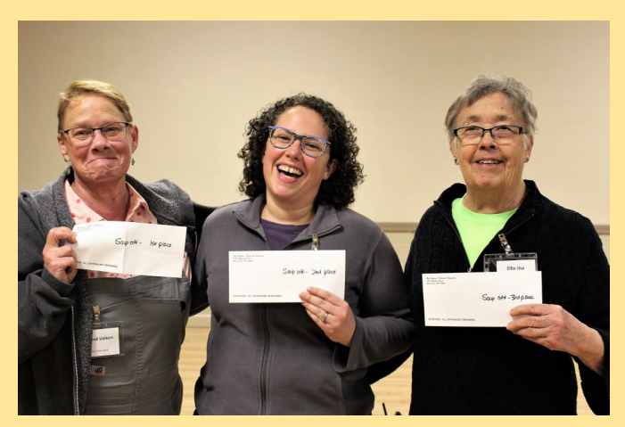
Low Country Chowder

1/4 stick butter 1 onion chopped 1 large celery rib chopped baby carrots chopped