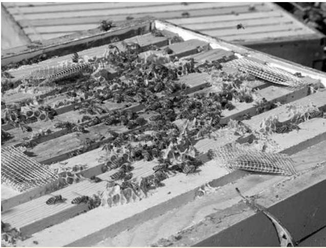
Figure 4. Apilife VAR. N.C. State Apicultural Program

gest a more moderate level of control. This method requires significant time, labor, and hive manipulation, making it difficult to use in large-scale beekeeping operations. Nonetheless, it is a good alternative to other control methods that are either less effective or that utilize more stringent pesticides, particularly when dealing with only a few hives.