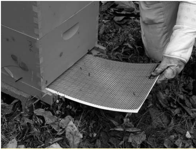
Figure 3. The sticky board method for estimating mite load. N.C. State Apicultural Program