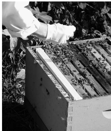
Figure 5. Administering chemical pesticides. N.C. State Apicultural Program

Checkmite+. The EPA registered another synthetic chemical as a Section 18 emergency-use pesticide for varroa control. Checkmite+, the trade name for coumaphos, is also sold as a plastic strip impregnated with the active pesticide. When the bees and mites come into contact with the pesticide, it can provide up to 100 percent control when used properly. Coumaphos is a member of the organophosphate group of pesticides, and residues can accumulate in wax and be harmful to bees at high levels. As with Apistan, there have been documented cases of varroa mites developing resistance to this pesticide, so it is important to use it according to label directions and to alternate its use with other approved treatments. Checkmite+ is also registered for the control of the small hive beetle ( Aethena tumida ), and its sale in North Carolina is restricted to those individuals who have a valid N.C. Pesticide Applicators License.