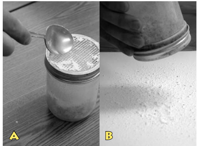
Figure 2. The sugar shake method for estimating mite levels. N.C. State Apicultural Program