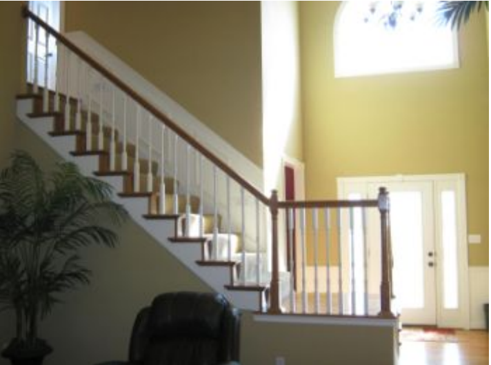
Missing handrails at the interior basement steps. Some one can slip & fall. Recommend having railings at all interior steps including the attic.