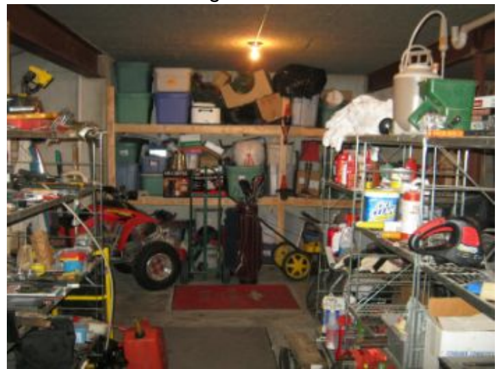
Limited review due to storage of personal property and finished walls.