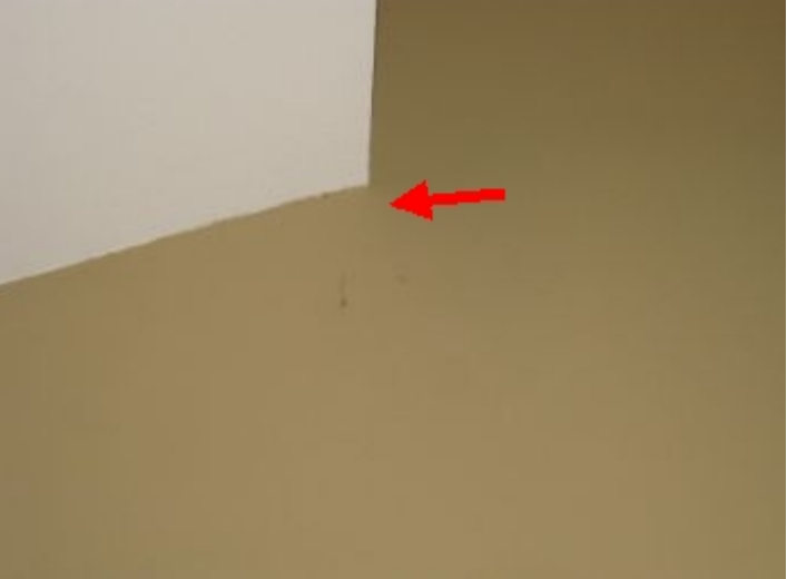
Common small settling cracks in wall and ceiling finish observed. This normal wear for age of home. Recommend repair and paint