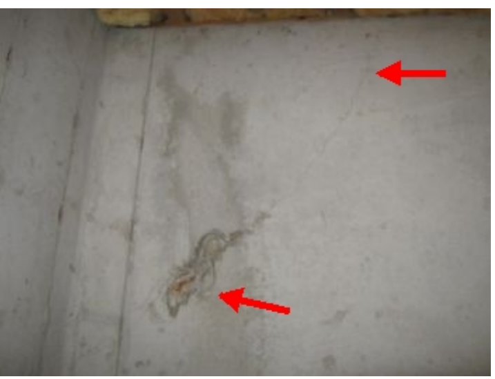
Common cracks. Recommend monitoring over time for increased cracking activity. Recommend sealing of current cracks to minimize intrusion of water/moisture/insects/radon into the building.