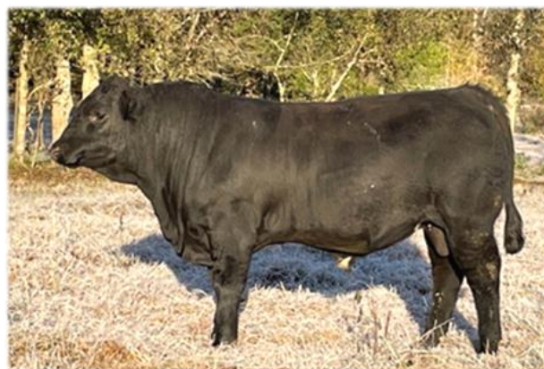
RS-JED J79 - Service Sire of Lots 72-75 & 83

This is a nice big, long bodied, heifer that has plenty of performance. Her mother is one of our best Yellowstone cows who does a great job! Our CCR Cowboy Cut females are making productive cows we can count on to breed early, milk well, and maintain their condition. She is due in late Dec. to RS-Jed J79 (ASA#4041447).