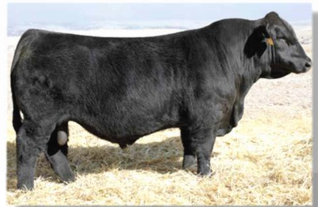
KBHR Honor - Sire of Lot 50 & 87A