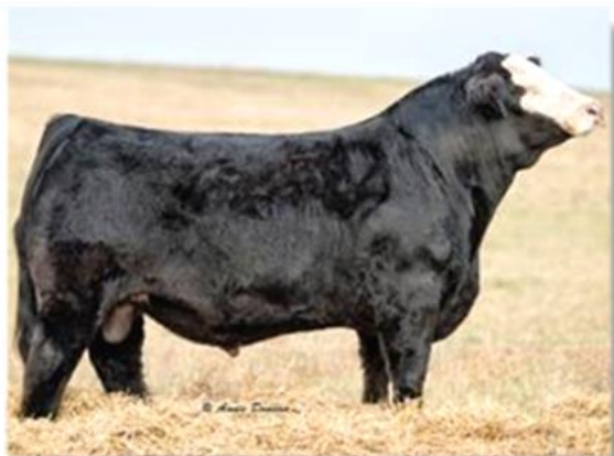
SSC Shell Shocked - Sire of Lots 104 & 108

H112H is a 3/4 Simmental, Shell Shocked female and goes back to Remington Sandra. She is well designed end to end. It is hard to let a great cow like this go. She has been a great producer. Her December 2022 bull calf is selling in the sale. PE to MF Handsome H63D (ASA#3748029) 1/1/23 - 3/31/23