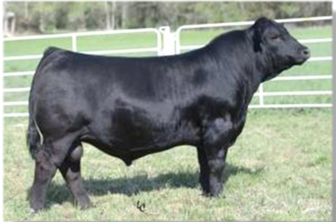
WS Proclamation - Sire of Lots 7, 42, 53, & 92

This taller framed bull is out of one of our best cows. He has a good calving ease EPD of 15.7, milk EPD of 29.6, stay EPD of 20.4, and top 15% for API. TAEP Approved!