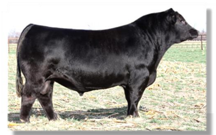
CLRS Divided - AI Sire of Lots 97A & 98A

TTU Minnie, otherwise known here as "Brownie" is a high capacity female with a picture perfect udder. She calves early in the season every year and has a bull calf at side by CLRS Dividend born 9/28/23 at 80 lbs.