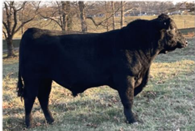
TTU Stetson H710 - Sire of Lots 38-40 & 51 &

TTU Claire is a beautiful dark red cow that has been a good producer for us, with a daughter and a son in this sale offering. She is a long spined, broody female that maintains her condition quite well while raising a nice calf! She comes to you heavy bred to TTU Stetson H710 (ASA#3828649) for her third calf.