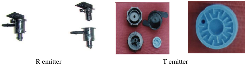
Fig. 1: Emitters' design and internal components.

Distribution uniformity (DU) indicator was used to express how the emitters can distribute water uniformly to the crop or soil (Burt et al. , 1997). Distribution not only can deprive portions of the crop of needed water, but, furthermore, can over-irrigate portions of a field, leading to water-logging, plant injury, salinization, and transport of chemicals to the ground water (Solomon 1983). In order to measure DU, laterals were imaginary divided into 4 quarters. At 10m operation head, samples of 7 emitters from each quarter were chosen to measure the flow rate of the chosen emitters. Graded cup 1 ml accuracy was put under each emitter sample all at once for 2 minutes to calculate the emitters' flow rate.. DU was calculated using the following equation (Marriam and Keller, 1978):-