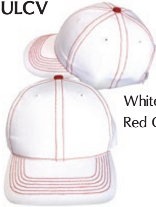
White w. Red Contrast