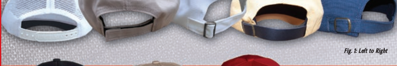
Fig. 1: Left to Right