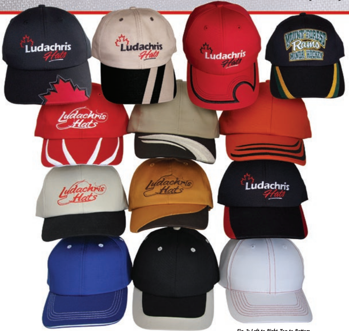
Fig. 2: Left to Right, Top to Bottom