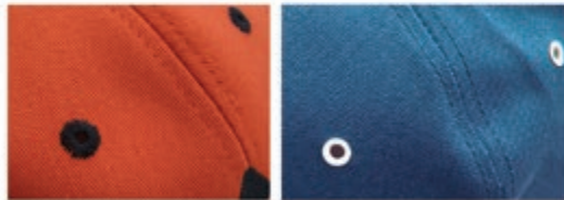
Fig. 3: Left to Right