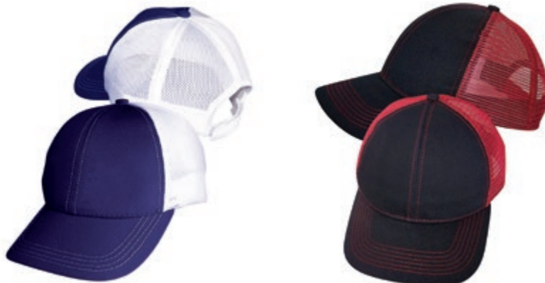
Navy w. White Mesh