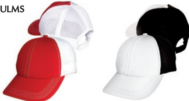
Red w. White Mesh