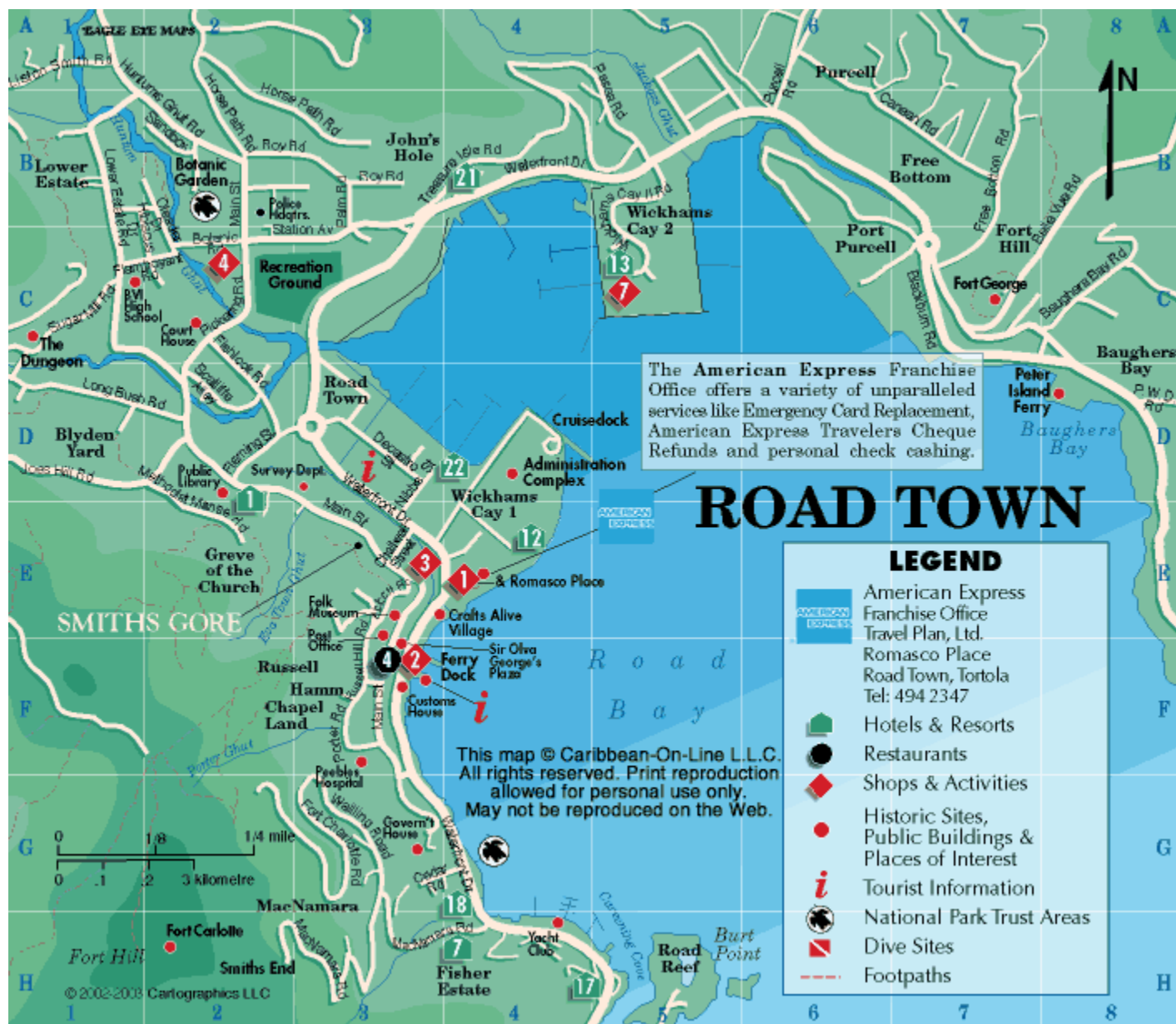
Tortola Cruise Port area map